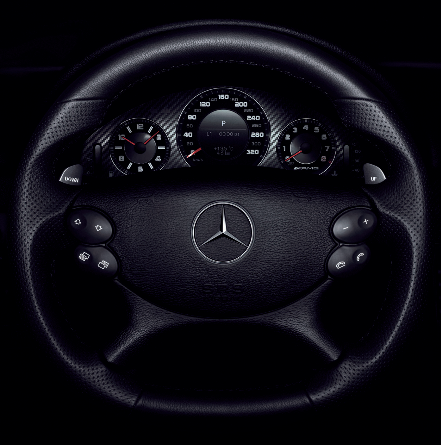
Experience that team driver feel: the AMG performance steering wheel, which measures 365 mm in diameter, is levelled off at the lower edge. The aluminium shift paddles make for fast and extremely ergonomic gear changes. And to help you keep track of what the CLK 63 AMG Black Series is capable of, the instruments in the carbon fibre dashboard feature red needles. Sit back and savour the exceptional sensory experience.